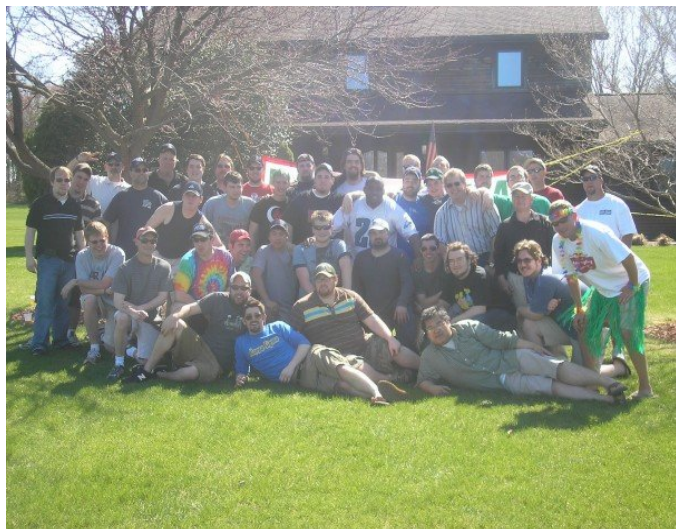
This is what Fellowship is all about.