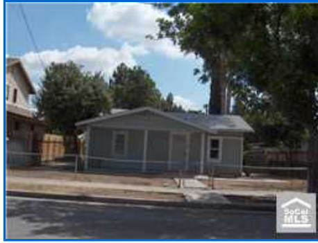
FRONT OF SUBJECT

The accuracy of all information regardless of source, including but not limited to square footages and lot size, is deemed reliable but is not guaranteed and should be independently verified through personal inspection by and/or with the appropriate professionals. Copyright SoCalMLS.