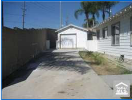
Driveway and garage