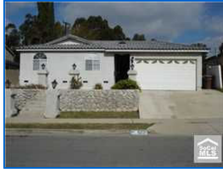
MLS#: P620627 - 623 Pepperwood