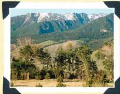
View to the east