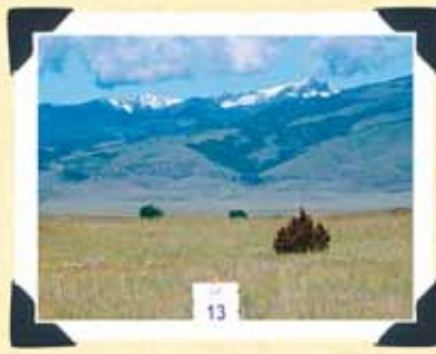
View west of parcel 13