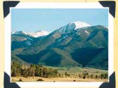
View to the south