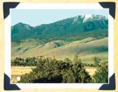
View northeast of parcel 12