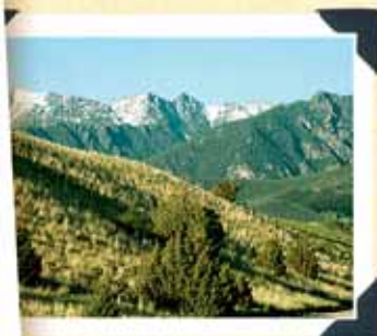
View to the east