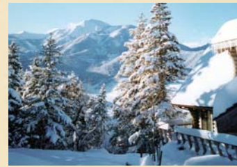
A winter wonderland