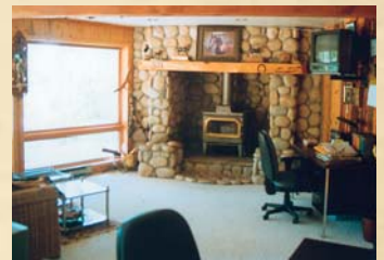
Downstairs living and fireplace