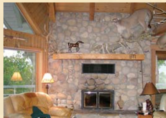
River rock fireplace