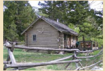
Rustic guest cabin