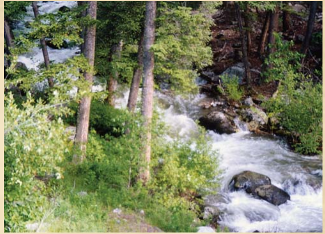
Enjoy your very own creek.