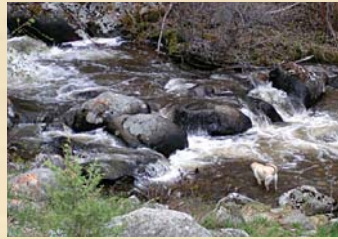
Home next to Elbow Creek