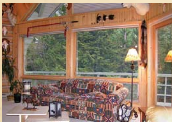
Spacious living room