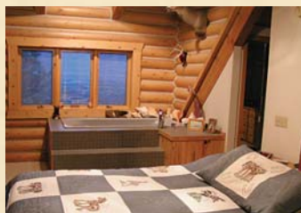
Upstairs master bedroom