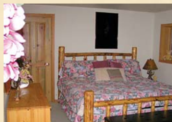
Two bedrooms downstairs