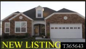
NEW LISTING T365643